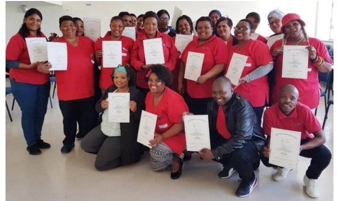
HOPE Cape Town's employees after completing the 'Continuous Grief, Loss and Trauma' course, standing proudly with their certificates.