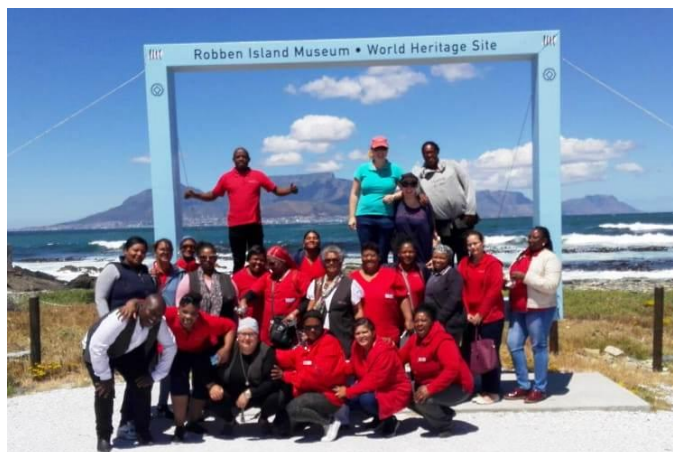
HOPE Cape Town's Community Health Workers posing with the Robben Island Yellow Frame.