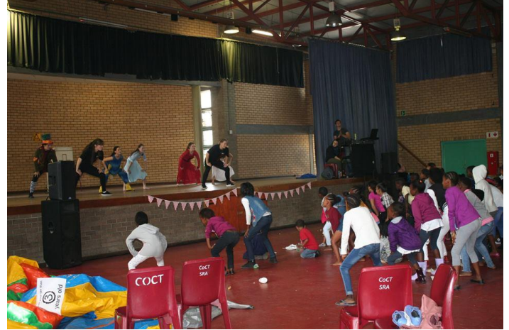
The children attending the party in Delft learning hip-hop moves from a hip-hop instructor.

The children's party is regarded as a motivation for the patients to attend the clinic on a regular basis and receive the necessary treatment and take their prescribed medication. As a reward, HOPE Cape Town hosted the Delft Children's Party for the patients at the Delft civic centre, where the children enjoyed activities such as jumping castles, receive beauty treatments - manicures and pedicures, have lunch together with their parents and guardians, learn dance moves from a hip-hop instructor, participate in a talent show, and receive a gift.