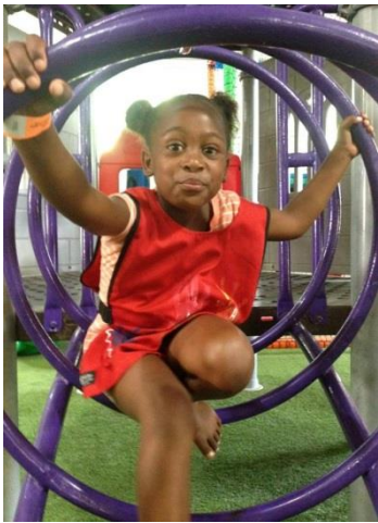
One of the Blikkiesdorp playgroup children enjoying the challenging obstacles at Bugz Playpark.

Thursday the 29 th of November 2018 marked the last playgroup at Blikkiesdorp for 2018 and the children celebrated by going on an outing to Bugz Playpark - where they were accompanied by HOPE Cape Town staff members and HOPE Cape Town past- and current volunteers.