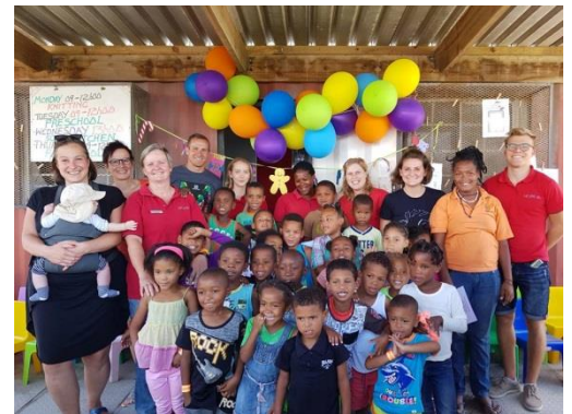
The Blikkiesdorp playgroup at their graduation ceremony, accompanied by HOPE Cape Town staff members and HOPE Cape Town past- and current volunteers.

We are extremely proud of our Blikkiesdorp playgroup children who attended the playgroup regularly throughout the year and committed themselves to learning and developing their skills and knowledge. During the afternoon of the 29 th of November 2018, the Blikkiesdorp playgroup had their graduation, whereby each child received their report, a certificate and a school bag. Good luck to the children starting school and attending grade 1 in 2019!