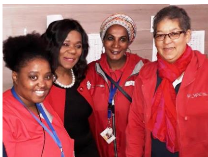
Violet, Sonia, and Pauline from HOPE Cape Town attended Thuli Madonsela's lecture on the 6 th of November 2018.

On the 31 st of October 2018, the community health workers of HOPE Cape Town boarded a boat to Robben Island to visit historical landmarks and to learn more about the history of Robben Island and South Africa as a whole. The day was filled with laughter and learning, as the HOPE Cape Town team gained valuable knowledge regarding Robben Island, the history of South Africa, and the living conditions of the former Robben Island prisoners.