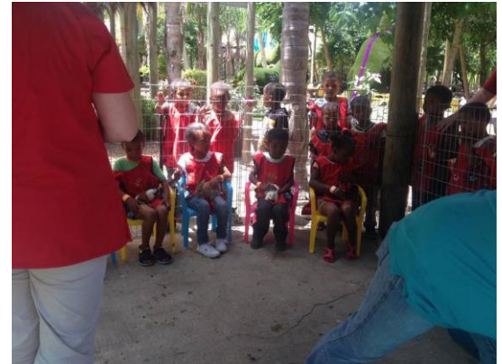
The Blikkiesdorp playgroup children inside the petting zoo at Bugz Playpark, petting and learning about animals.

The Blikkiesdorp playgroup children were treated to hours of play on the jungle gyms, slides, swings, play houses, tree houses, and obstacles. The children were also introduced to Bugz Playpark's petting-zoo, during which the children got to hold, nurture, and learn about geese, guinea pigs, and rabbits. To end the outing off, lunches were served to the children, as well as goodie bags with sweets and treats, and a cupcake.