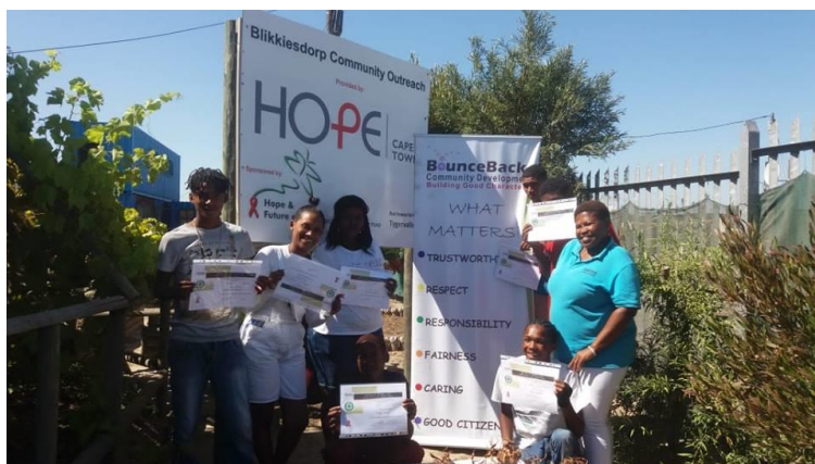
Blikkiesdorp Students of the BounceBack Community Training Initiative (Belhar Branch) who graduated with certificates in First Aid and CPR.

Following an intensive training course the youth attended a graduation ceremony and were awarded with certificates of competence. BounceBack provides a number of training courses for young people who want to increase their knowledge and skills in order to improve their employment opportunities.