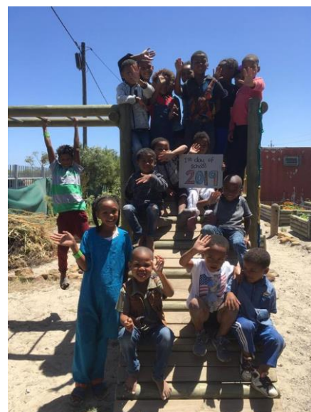
The Class of 2019 preparing for the start of their school career. This year they will learn numeracy and literacy as well as soft skills.