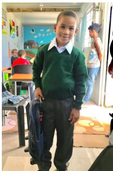
First Day of Primary School