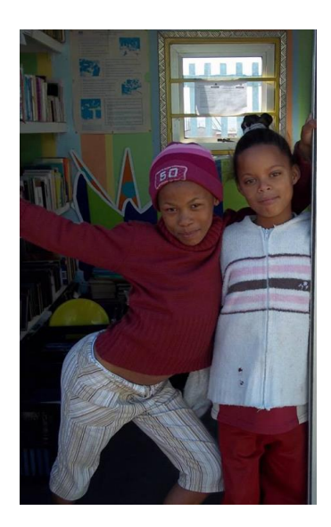
Children from Blikkiesdorp

The HOPE Cape Town Trust was launched in Cape Town, South Africa in May 2006 at our annual fundraising event, the Ball of HOPE. After many years of successful public and private partnership with a diversity of stakeholders including committed Government entities, organisations, businesses and individuals in South Africa and Germany, the bold decision to form a Trust to ensure the sustainability of the HOPE Cape Town Association was taken. This step is evidence of a shared commitment to the future of HOPE Cape Town predicated on our strong belief in the fundamentals of the organisation and the resolve to support this undertaking by the volunteer Board members of HOPE Cape Town Association, the staff and, of course, our Trustees.