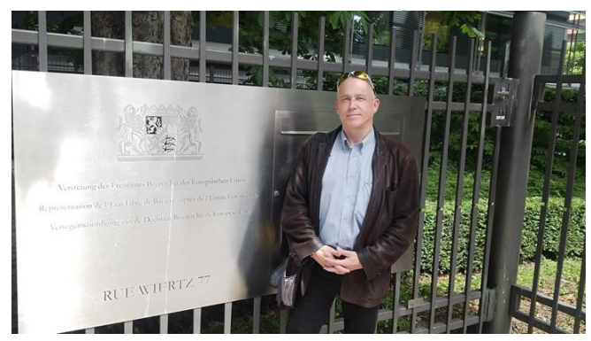
The Bavarian Representation in Bruxelles

HOPE Cape Town Trust continues to be a member of the Western Cape Network for Community Peace and Development which forms an integral part of the partnership between the Western Cape and Bavaria. In Bavaria, the "Freundeskreis HOPE Cape Town Trust e. V." continues to work as a part of the "Eine Welt Netzwerk Bayern".