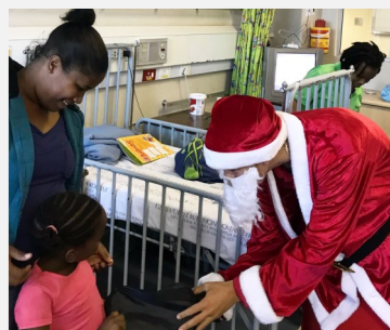
Christmas was celebrated at the HOPE Cape Town office, Blikkiesdorp, and Tygerberg Hospital

HOPE Cape Town Room 0005A, K Floor Education Building Faculty of Medicine and Health Sciences University of Stellenbosch Tygerberg Campus Francie van Zijl Drive Tygerberg 7505 Western Cape SOUTH AFRICA