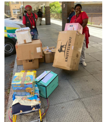
Donations delivery for the HOPE Cape Town playroom at Tygerberg Children's Hospital and the Tygerberg Hospital School.