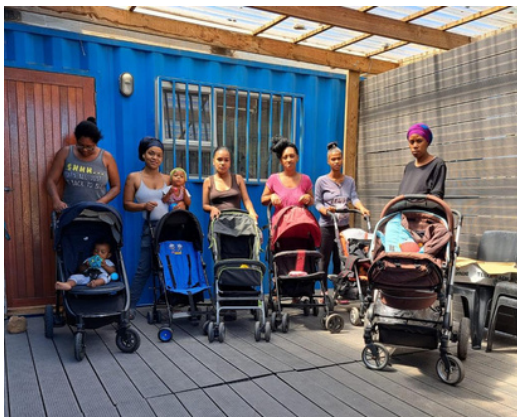
Moms receiving prams at the Blikkiesdorp Community Outreach Centre

The distribution of toys, games, stationery and equipment collected as part of the Dresden Container project has been concluded.