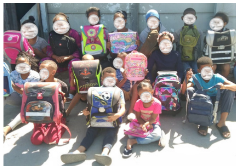
Many kids blessed with school bags for the year