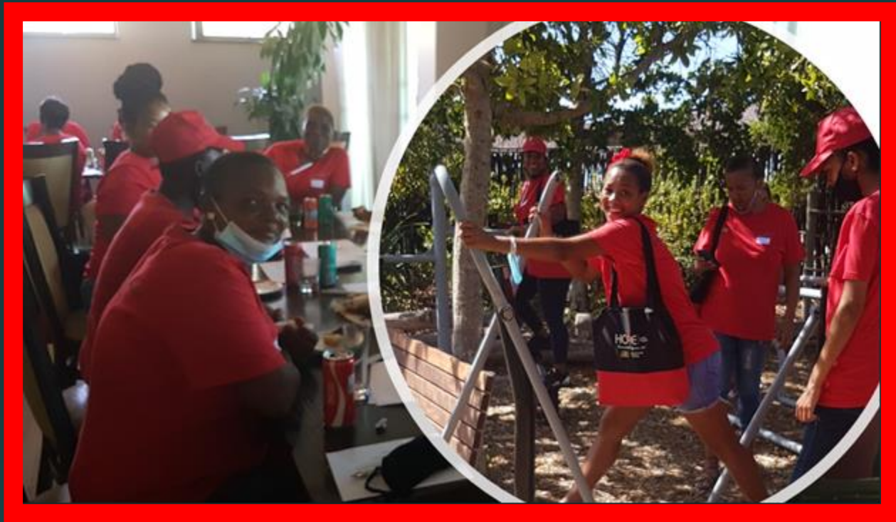
Womandla Women's Empowerment Groups learn about green principles, sustainability and eco-friendly measures.

The Womandla 2020 Women's Empowerment Program continued into 2021 as we brought all three groups of women together for a program evaluation and a little bit of fun. In mid-2021 fourteen of these young women will be invited to enroll for a digital literacy training course that will help them to become familiar with technology by using online resources.