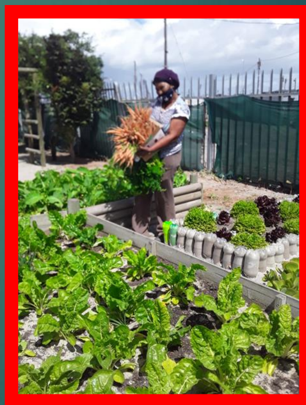
Carrots and spinach for the cooking pots.