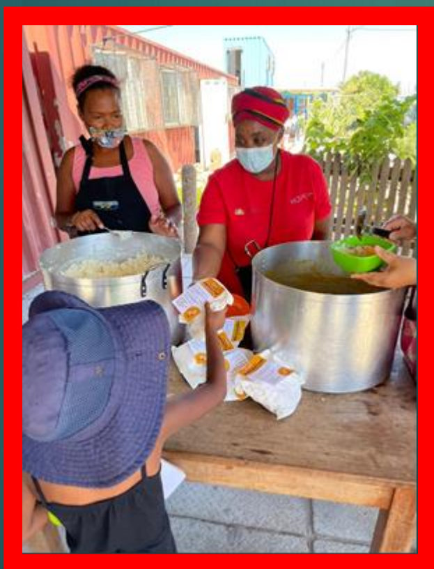
Lunchtime in Blikkiesdorp.

The community garden at the HOPE Cape Town Outreach Centre is lovingly nurtured by Blikkiesdorp residents and volunteers who ensure that the harvested produce is used in the preparation of the daily meals and shared with the local community.