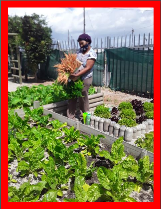
Carrots and spinach for the cooking pots.