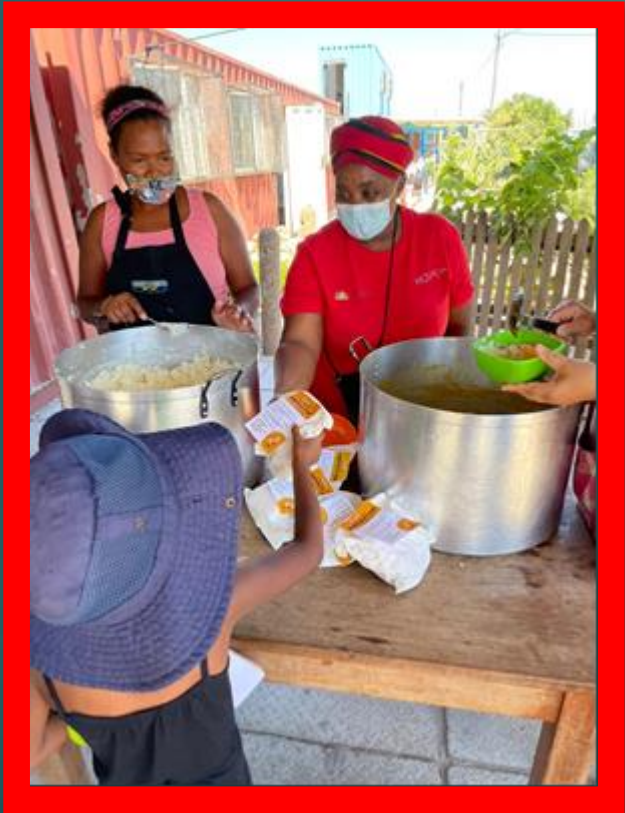
Lunchtime in Blikkiesdorp.

The community garden at the HOPE Cape Town Outreach Centre is lovingly nurtured by Blikkiesdorp residents and volunteers who ensure that the harvested produce is used in the preparation of the daily meals and shared with the local community.