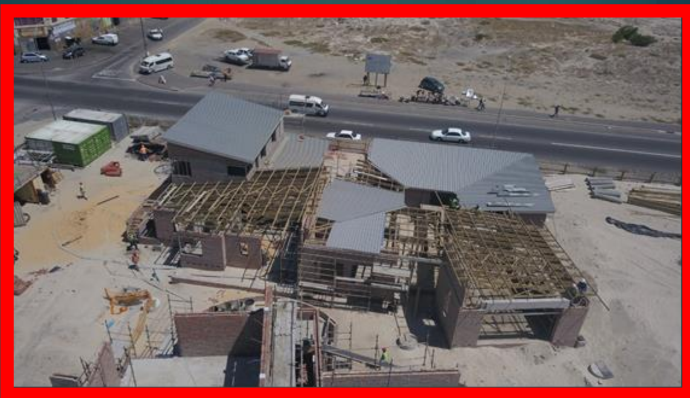
The Nex under construction: The Admin Block and Health & Wellness Centre.