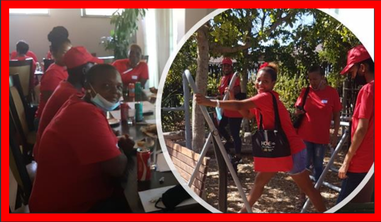
Womandla Women's Empowerment Groups learn about green principles, sustainability and eco-friendly measures.

The Womandla 2020 Women's Empowerment Program continued into 2021 as we brought all three groups of women together for a program evaluation and a little bit of fun. In mid-2021 fourteen of these young women will be invited to enroll for a digital literacy training course that will help them to become familiar with technology by using online resources.